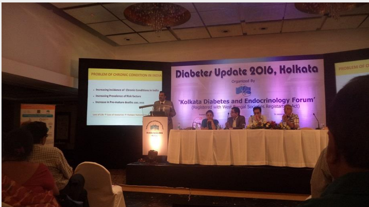
Dr Sandeep Bhalla from PHFI talking about various capacity building courses