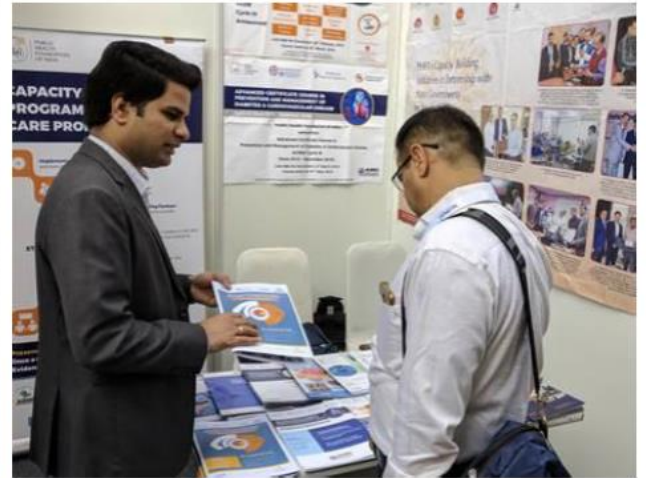
Delegates visiting PHFI stall and enquiring about various courses